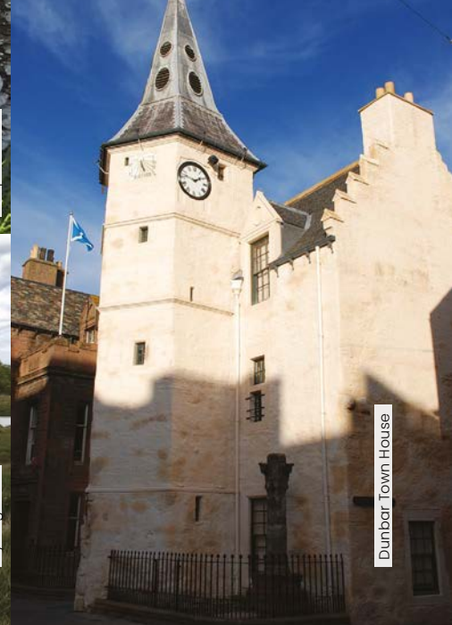
Dunbar Town House