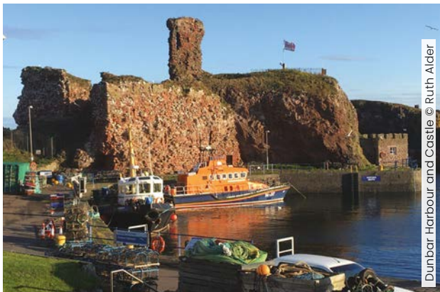
Dunbar Harbour and Castle