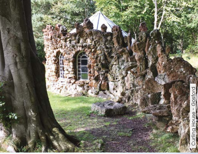
Curling House - Gosford