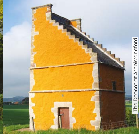
The Doocot at Athelstaneford