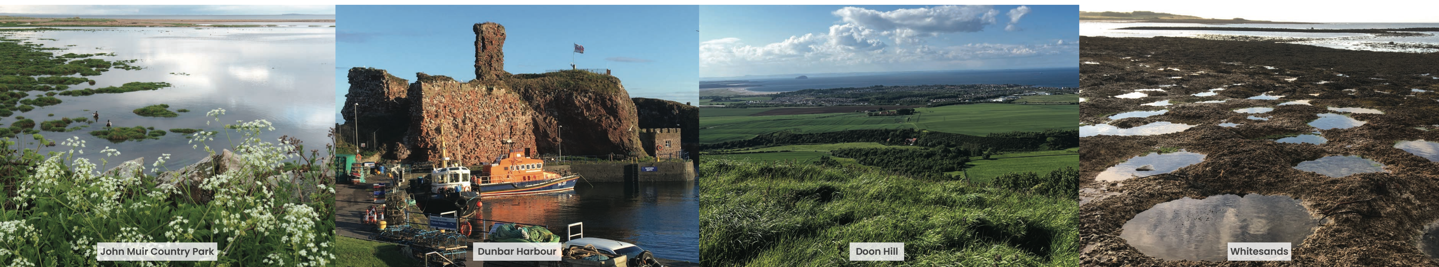
John Muir Country Park